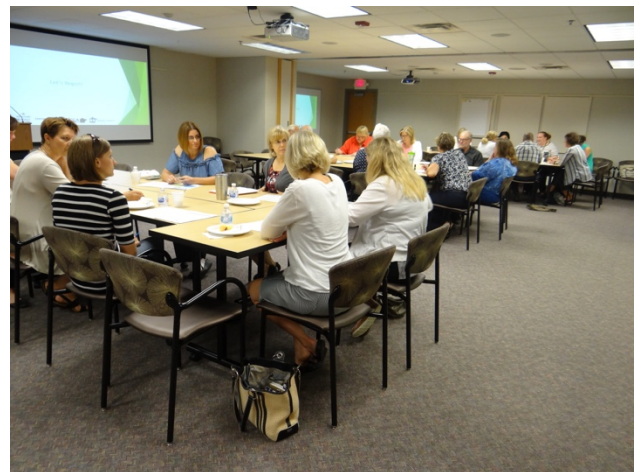
MAPP Prioritization Meeting

Informal conversations over coffee is where our journey started and was ultimately nurtured by a two day training opportunity in May of 2017 on Mobilizing for Action through Planning and Partnership (MAPP). All organizations involved in the Wright County Community Health Collaborative were able to attend. Shortly after this training in one of our meeting we all agreed upon that it made sense to use the MAPP model and committed to each other we were in this journey together.