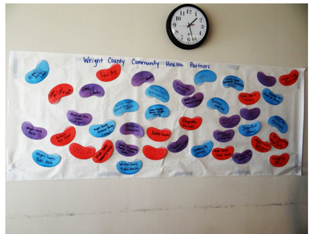
MAPP Community Partners

Some of the evaluation sources include but not limited to the Minnesota student survey, local Wright County survey (comparative data will be analyzed; the collaborative will strive to deploy new survey in 2021), treatment admissions, Electronic Medical Record (EMR) data, number of people reached through educational efforts and community presentations.