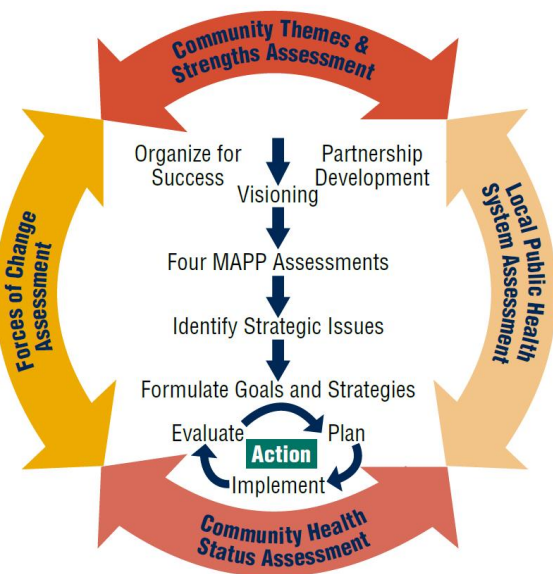
Mapp Process Model

The partnership adopted the MAPP model for assessment and planning. MAPP is a community-driven strategic planning process for improving community health. Facilitated by public health leaders, this framework helps communities apply strategic thinking to prioritize public health issues and identify resources to address them. MAPP is not an agency-focused assessment process; rather, it is an interactive process that can improve the efficiency, effectiveness, and ultimately the performance of local public health systems. Community ownership is a key component of MAPP. Participation from the broader community leads to collective thinking and sustainable solutions to complex problems.