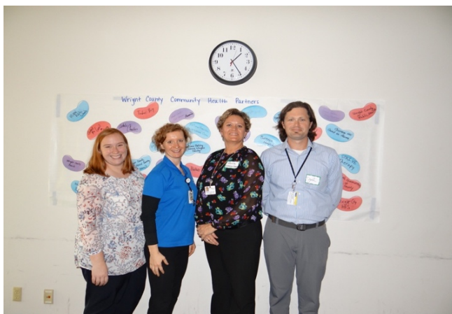
Wright County Community Collaborative members at the visioning event