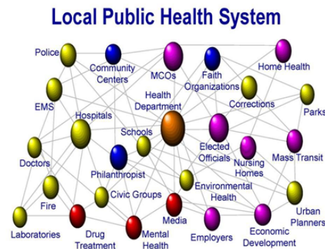
Local Public Health System Structure

In 2016, Wright County Public Health made a decision to align its local public health CHNA cycle with the two large healthcare systems operating in the community – Buffalo Hospital, part of Allina Health, and CentraCare - Monticello. WCCA was included to better understand the specific health needs within low-income populations and enable all participating organizations to work together in conducting data collection, data analysis and prioritization process. WCCA plans to conduct a joint assessment every three years.