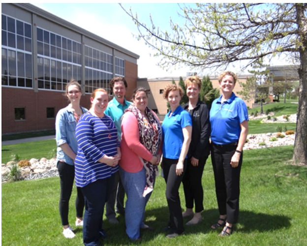
Wright County Community Health Collaborative members