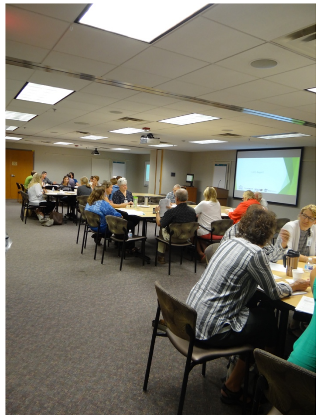
MAPP Prioritization Meeting