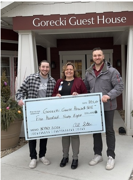
Thank you to All-Star Nutrition for conducting a New Year, New You challenge for their clients. They donated $1 to Gorecki Guest House for every percent of weight lost or muscle gained. The final gift was $568!