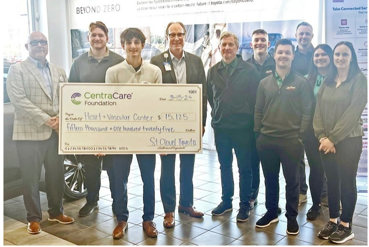
Thank you, St. Cloud Toyota, for supporting our Heart & Vascular Center patients! During American Heart Month in February, they donated $100 for every used vehicle purchased raising a total of $15,125!