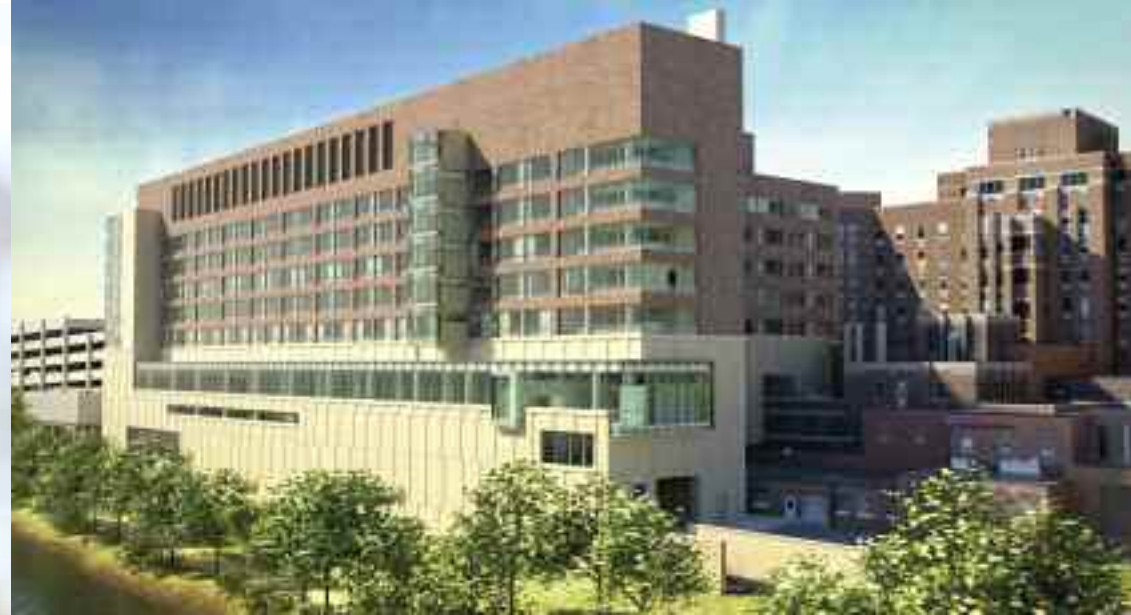
Future look of St. Cloud Hospital from riverside

As part of the overall investment, CentraCare Health Foundation has set a goal of raising $21.7 million to support pieces of the project that wouldn't be possible without the generosity of the community.