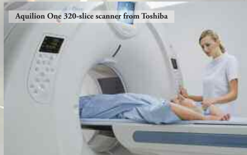
Aquilion One 320-slice scanner from Toshiba

My Healthy News , a free, monthly e-newsletter from CentraCare Health System, is available to the public to choose the topics and services that matter to them. Then we send up-to-date information from national health resources that are personalized to their needs and interests.