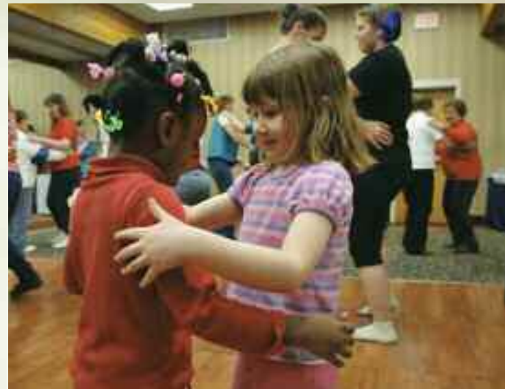
Two little dancers work on their new moves at Day of Dance.

CentraCare Health System – Melrose offered free certified nurses assistant, diabetes and childbirth classes, along with rehabilitation services to high school students for sports safety.