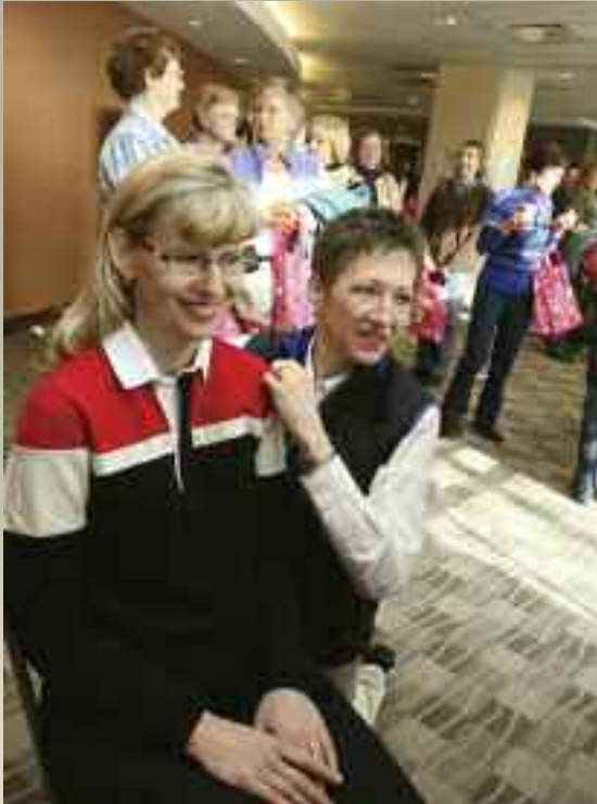
Local women participate in video otoscope evaluation of the ears at Women's Health 101.