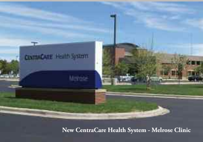
New CentraCare Health System - Melrose Clinic

CentraCare Health System – Melrose Hospital opened a new main entrance to the west (the old clinic entrance), making the care process and patient flow through the hospital more user-friendly. The move enables patients and visitors to have access to ample parking. The old clinic space was remodeled and became part of the hospital's outpatient service area where visiting specialists treat patients. Admitting and the Business Office also are located there. A new rehabilitation department was added to the hospital.